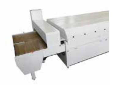
Exhaust fumes and outlet cooling hood