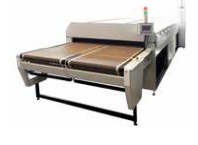
Dual belts configuration