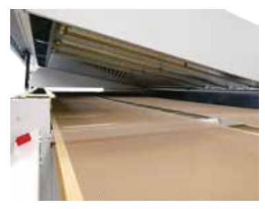
Infrared Lamps and upper section opening

Tunnel Lenght: 4000 - 6000 - 8000 mm Belt Width: 1400 - 1750 - 2×800 mm